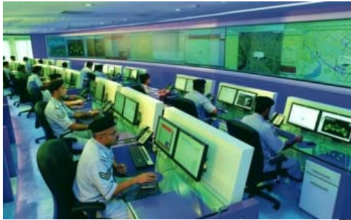
The comprehensive monitoring of data in the Meydan, Dubai development data centre will insure continual optimised operation of all buildings